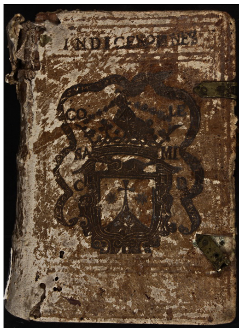
Photo 1. Lviv Discalced Carmelites Monastery's superexlibris.