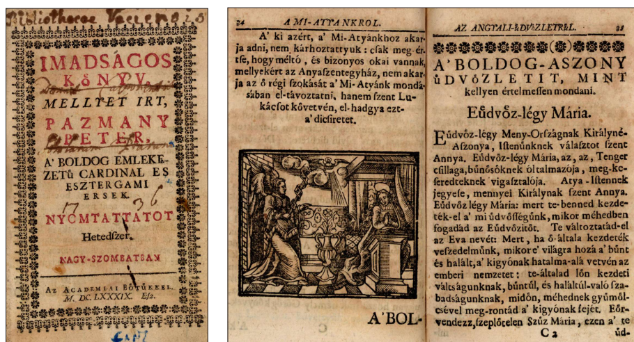
Fig. 3a, b. P. Pázmány, Imadsagos Könyv... Nagy Szombatban... M.DC.LXXXIX (1689) 24